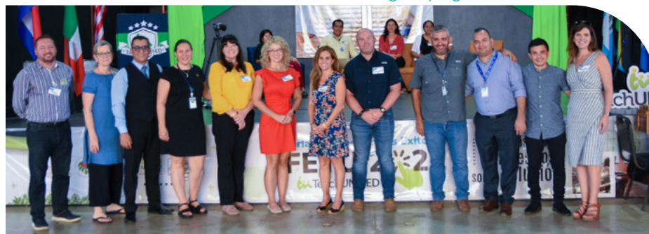
Several TeachUNITED staff and board members visiting our program in Costa Rica